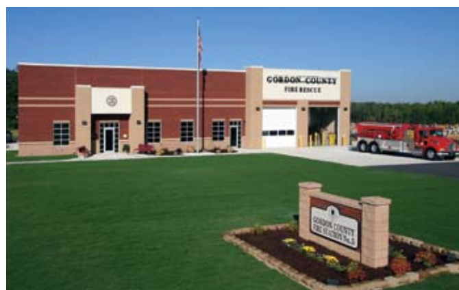
gordon county fire substation

Stewart • Cooper • Newell Architects understands this and has spent the last 30 years designing Fire and EMS facilities that are functional, durable and cost-effective. Our extensive experience has allowed us to design well over 160 Fire and EMS facilities of all types and sizes across the United States. Whether your department is volunteer, career or a mix of both, Stewart • Cooper • Newell Architects has the time and resources to assist you now. [i]